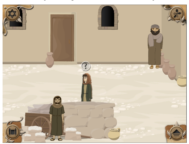
Figure 1. The Player Traversing the World

game, Jerusalem teeters on the verge of destruction at the hands of the Roman Empire during the time of the Second Temple.