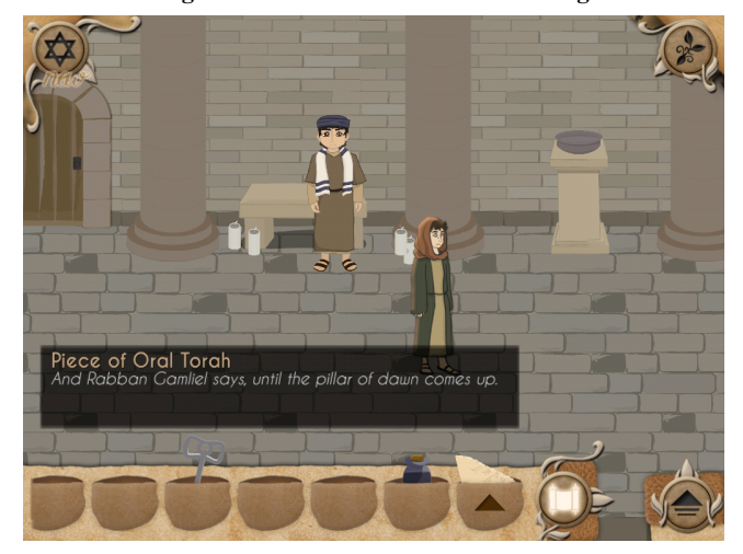
Figure 5. Inventory System

At stake is the spiritual and physical future of the Jewish people. Yet, hope prevails in the form of student and teacher. In the game, the player assumes the role of a Talmud (student of the Torah) on a quest to save the oral tradition. The game draws on an "Adventure" style gameplay, where the player traverses Jerusalem