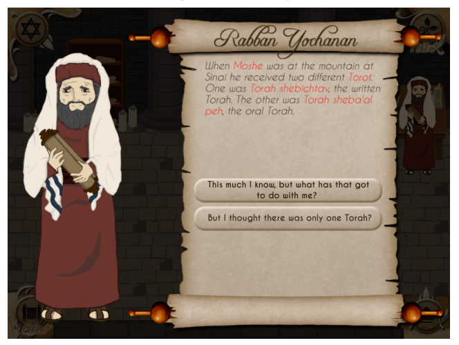
Figure 4. Interactive Character Dialog