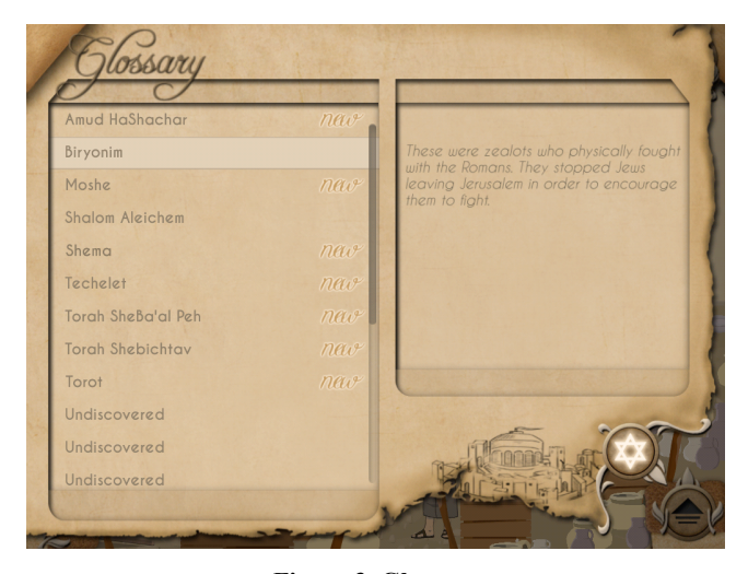
Figure 3. Glossary