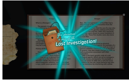
Figure 3. FLARE-based reward animation in CRYSTAL ISLAND.

significant events, so FLARE is used to display a visual flourish to reward students as shown in Figure 3.